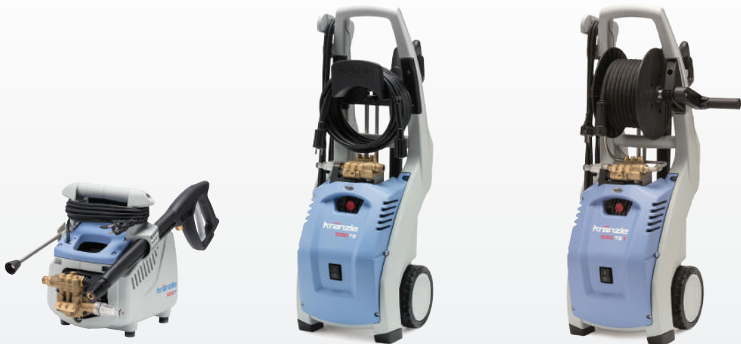
Portable and Compact K 1050 P