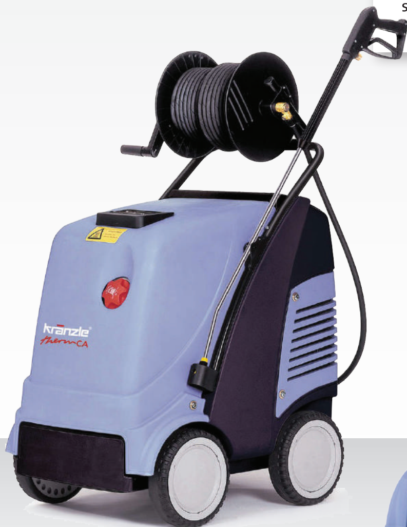
Therm CA with hose drum

Being one of the leader in implementing green enviroment and eco-friendly, Kranzle Germany have this equipment that you should consider if you want to improve your productivity doing the friendly way.