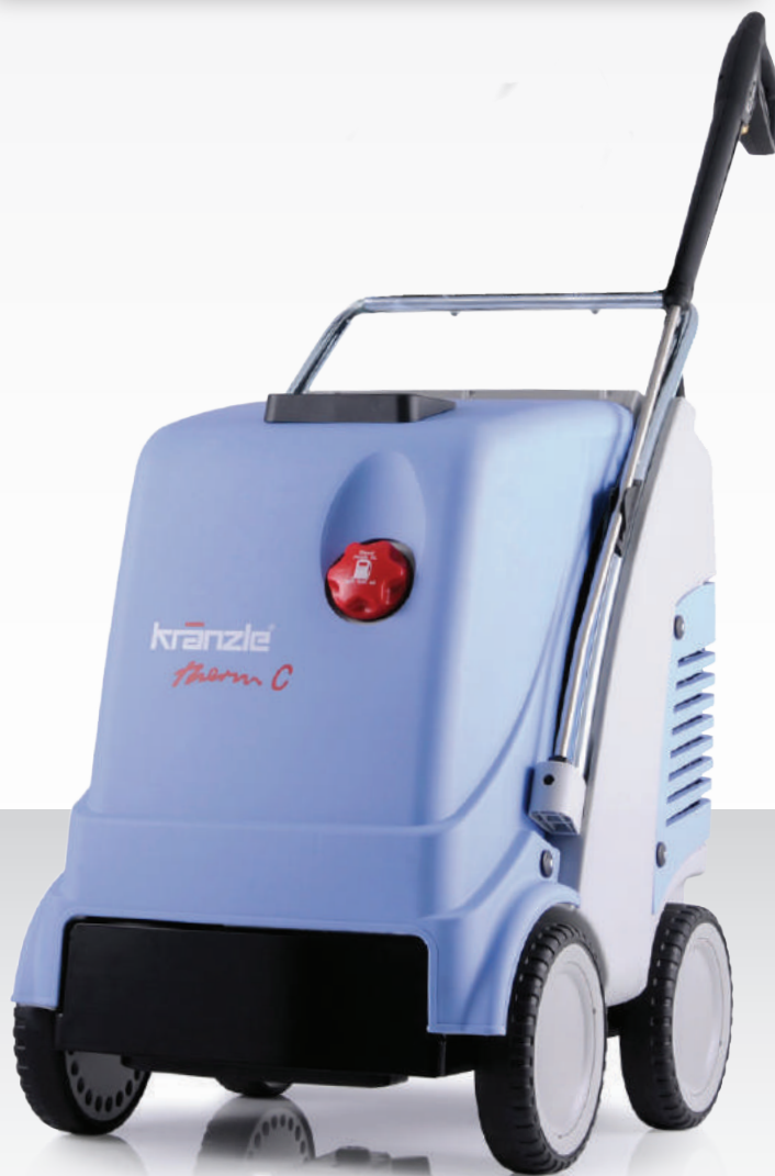
Therm C without hose drum